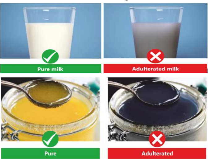
Figure1. Milk ( left ) and butter/ghee ( right ) adulteration which can be detected by simple starch test

Milk and milk products adulterated with starchy products can be identified through digestion of starch by first boiling 2-3 ml of sample in 5 ml of water, cooling and adding 2 to 3 drops of iodine and then formation of blue color indicates the presence of starch.